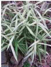
River Mist Sea Oats

Showy, 2' long silvery-white plumes have good fall color, clumping habit, fast growing. Up to 8-10' tall Not always happy through Wisconsin winters!