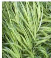
Golden Forest Grass