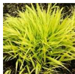
All Gold Forest Grass