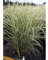
Jap. Silver Var.

Tall clump grass with yellow bands on the leaves. Silvery plumes are sometimes produced in autumn. Grows to 6 feet.