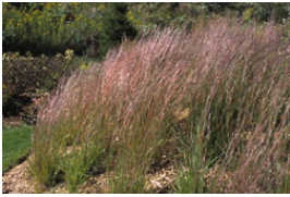
Little Bluestem 'Blaze'

Phalaris ' Strawberry n Cream ' Ribbon Grass Variegated foliage fades to pink. 2-3' tall