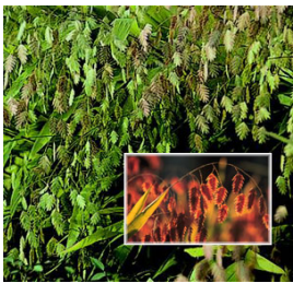
Northern Sea Oats

Native, wide-bladed grass with unusual and attractive seed heads in early summer. Shade tolerant. Grows to 3 feet. 'River Mist' variegated Sea Oats 30-36" tall x 24-36" wide