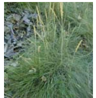
Tufted Hair Grass

Small, dense, finely textured mound of grass with silvery blue color. Prefers full sun and dry soil. Grows 8-10 inches tall. Usually not long lived. 'Boulder Blue'- metallic blue foliage