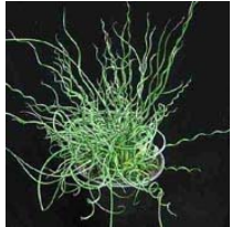
Big Twister Swamp

Larger than Blue Fescue, more tolerant of clay. Grows to 2-3 feet.