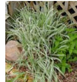
Strawberry n Cream Ribbon Grass

Phalaris ' Strawberry n Cream ' Ribbon Grass Variegated foliage fades to pink. 2-3' tall